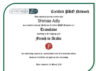
French > Arabic Certified translator